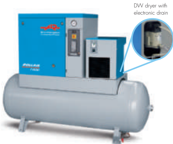
DW dryer with electronic drain