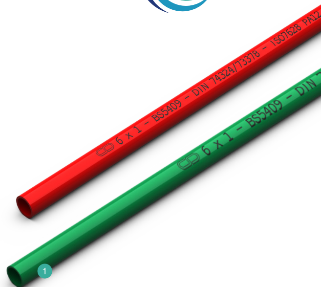
1. Impact modified PA12

Natural, black, red, blue, green and yellow