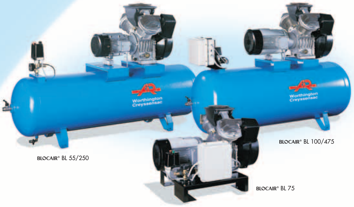
BLOCAIR® BL 55/250

The BLOCAIR® range of industrial piston air compressors was developed in the pure tradition of the Worthington-Creysensac product range. Designed using top quality materials, for maximum reliability, solidity and lifecycle, BLOCAIR® compressors comply with the requirements of even the most demanding of users.