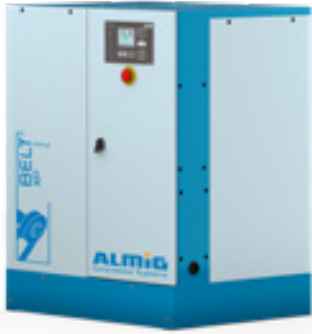
BELT XP 4-6