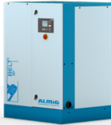
BELT XP 8-15