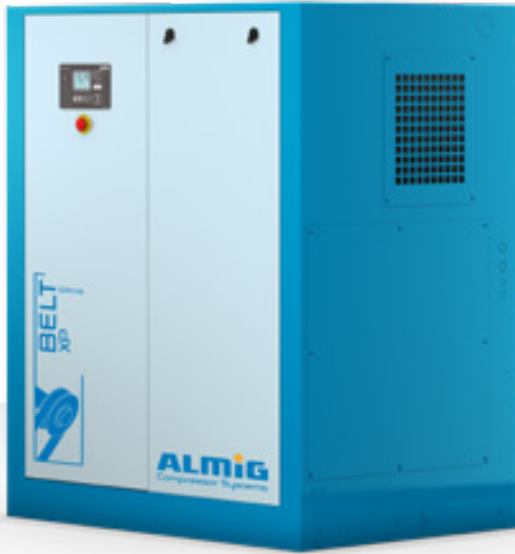
BELT XP 15-22