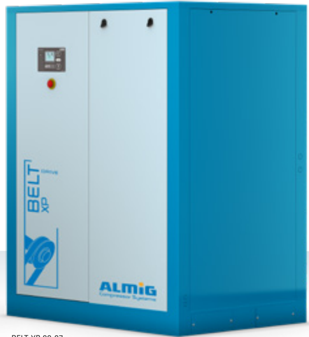
BELT XP 30-37