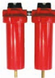
Metal Bowl Model 3P-060-MP4-DCI