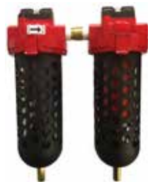
Polycarbonate Bowl Model 3P-060-PP4-DCI

The Eliminizer Combo incorporates the clean, dry air of the Eliminizer with a high efficiency borosilicate coalescer. This multi stage unit is designed for water and dirt removal in the first stage and oil aerosol removal to 0.01 micron in the second stage.