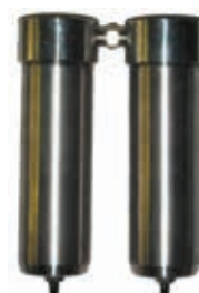
Stainless Steel Bowl Model 3P-060-SP4-DCI

The Eliminizer Combo is available with polycarbonate, metal or stainless steel bowls with connections from 1/4" to 1" and can handle flows up to 150 SCFM.